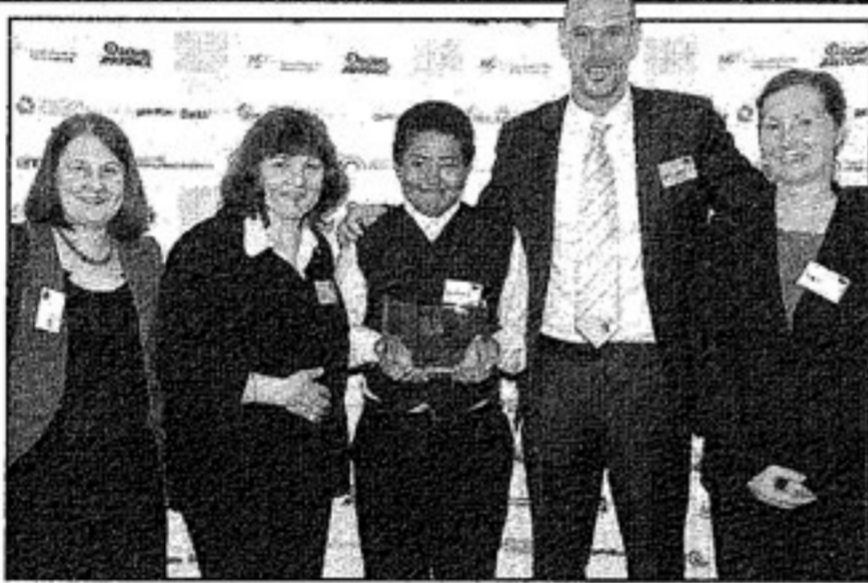
■ GRAFTON Primary School was named as one of the greenest schools in London