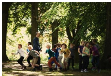
Ready, steady, HIDE!

We played a hide and seek game in a clearing.