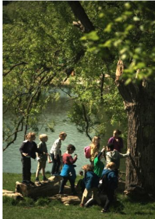
Hampstead Heath is 320 hectares or 3,200,000 km 2 which is half the size of Gibraltar!

The children are really enjoying themselves, identifying trees and plants from their leaves, and birds from their tweets!