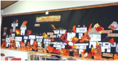
Sssunday, 2 nd Ssseptember, 1666 was a date that sssizzled!

You may have noticed that the back wall in Year 2 is on fire! No, not really! However, our multi media mural depicts homes inspired by those which were ravaged by the flames that gripped local London streets in the dry September of 1666. Did you know that 13,000 homes and 89 churches were razed to the ground due to the Great Fire of London? Little wonder when you realise that homes were made from wood using the wattle and daub technique. Frames were made from woven tree branches and compacted with a mixture of mud, straw and animal dung! We have an upcoming trip to the Museum of London on Tuesday 9 th June and we are looking for two parent helpers. If you'd like to join us, please let your child's teacher know.